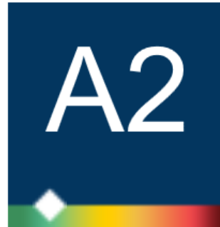
COUNTRY RISK ASSESSMENT